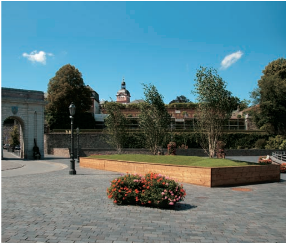
Weilbug an der Lahn located on the König-Konrad-Platz