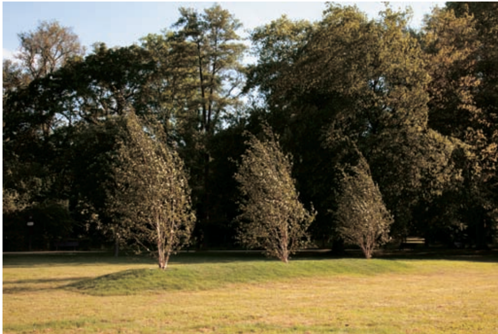
Timm Ulrichs – Tanzende Bäume (i.e. Dancing Trees)